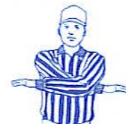
Incomplete forward pass