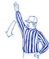
Penalty declined; no play