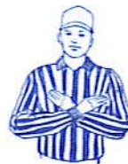
Delay of game