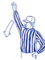
Ball ready for play